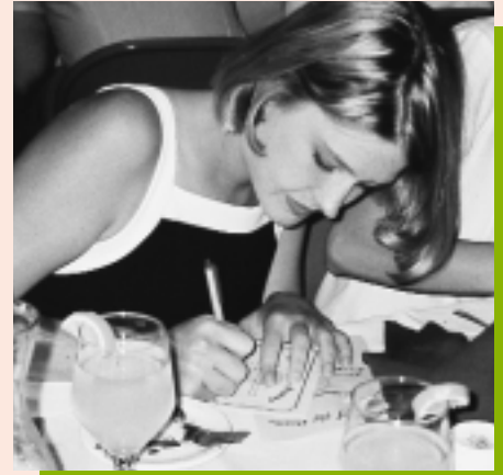
During the Honor and Etiquette Banquet, students sign an Honor Code card.

Character Camp and the Laws of Life Essay Contest do more than pay lip service to character development. At